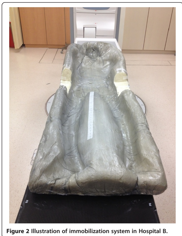
Figure 2 Illustration of immobilization system in Hospital B.

cut-out treatment window, a Styrofoam Feetfix and a tailor-made aquaplast sheet. The aquaplast sheet, which was a synthetic polymer [25], was heated to 77-81°C in a water bath. Due to its malleability after heating [16], the pliable sheet was then stretched and moulded to conform to the patient's external contours from waist to upper thigh. The sheet was locked into the baseplate on two lateral sides and between patients' thighs. It was then allowed to cool down and harden. The baseplate was not indexed to the couch. The Feetfix was used to assist in securing the lower legs, while a foam pad was used to ensure patient comfort.